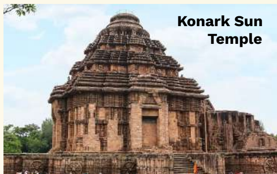
Konark Sun Temple